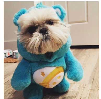
Artoo Shihtzu Sending you all a little care-bear stare from a spooktacular October and hoping for a nourishing November.