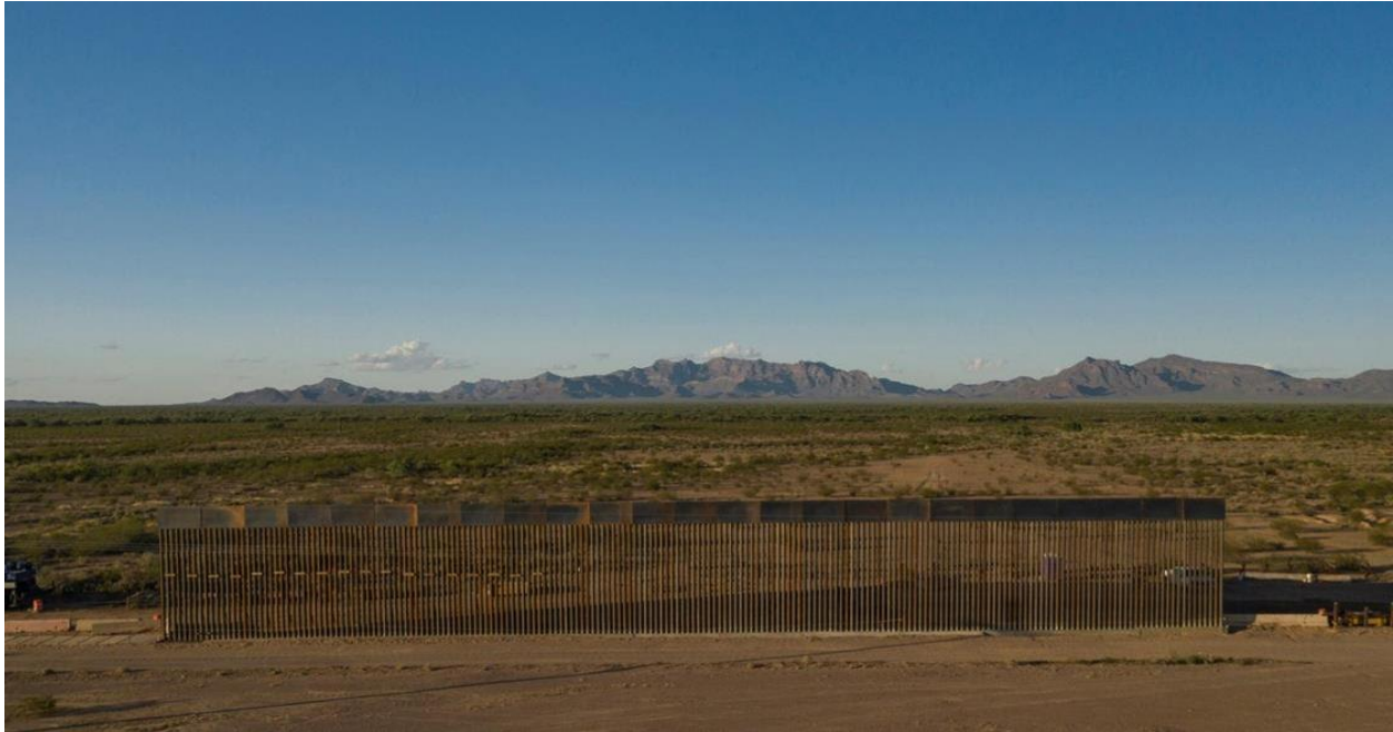
Fig. 4: The U.S. border wall construction in Organ Pipe Cactus National Monument as authorized by President Trump and the Department of Interior (Hatcher, 2019).

This politicization similarly applies to the Congressional representatives, Senators, and the state government of Utah considering it is well-known that the delegation specifically requested the reduction from the Trump administration. Back in 2017, Representative Rob Bishop (R-UT), chairing the House Natural Resources Committee, among the other three Congressmen and two Senators, admitted that the delegation sought for President Trump to overturn the former Obama administration's designation, criticizing the Antiquities Act (Siegler, 2017). It is evident that the Utah politicians, predominantly sympathetic to the energy and multiple-use platform of President Trump, are adamantly opposed to Bears Ears as a national monument. The BLM may have difficulties continuing to manage Bears Ears based on President Obama's Proclamation because of the opposition from the officeholders in the very state that the old national monument resides in.