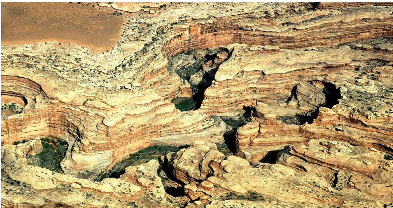
Fig. 1: Lower Grand Gulch, Bears Ears National Monument. By Robert Fillmore. (“Trump's Repeal of Utah Monuments Leaves Millions of Acres in Limbo,” n.d.).

biological entities. With an unparalleled fossil record in exposed rock dating back to the Ice Age, providing insight into ancient seas and dinosaurs, extraordinary biological diversity and rarity, and critical habitat for over 77 species, Bears Ears has meaningful grounds for scientific-based conservancy (Miller, 2018). For example, the canyons of Grand Gulch, in the western region of Bears Ears, serve as crucial terrain ranges for endangered mammals including the adaptive and characteristic desert bighorn sheep and threatened and sensitive native and local plant species (“Trump's Repeal of Utah Monuments Leaves Millions of Acres in Limbo,” n.d.). Plus, the boundaries of the national monument encompass some of the United States’ most scenic and remote locations, presenting the ideal aesthetic for outdoor recreational activity ( NRDC et al. v. Trump , 2017). Bordering the Natural Bridges National Monument in the western Bears Ears, the White Canyon complex is notable for backcountry canyoneering with walled stretches of “alcoves, arches, windows, hanging gardens, and grottoes” and over a hundred miles of narrow, serpentine slickrock canyons (“Trump's Repeal of Utah Monuments Leaves Millions of Acres in Limbo,” n.d.).