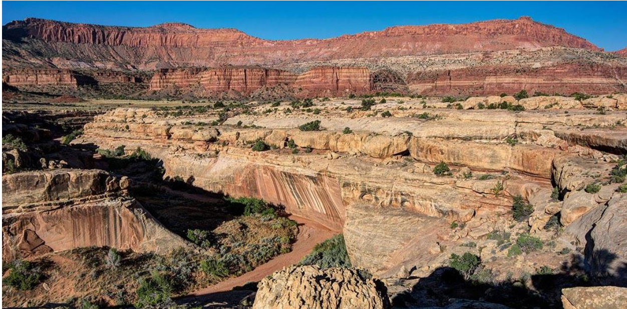
Fig. 2: White Canyon, Bears Ears National Monument. (“Trump's Repeal of Utah Monuments Leaves Millions of Acres in Limbo,” n.d.).